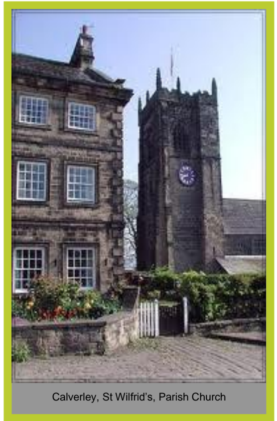
Calverley, St Wilfrid's, Parish Church

Calverley Pharmacy (J B Liptrot) 100 Thornhill Street, Calverley, LS28 5PD 0113 256 4573