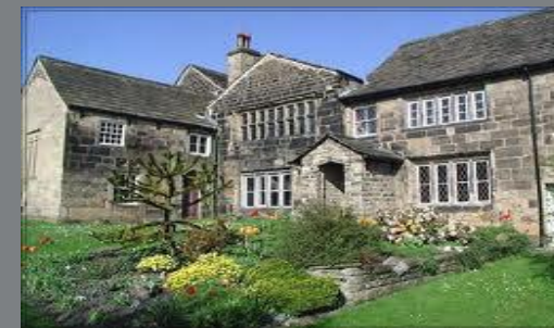
Calverley Old Hall

Pudsey Station – regular train service to Leeds, Bradford and beyond (20 minute walk) Bus Services – 670, 760, 62